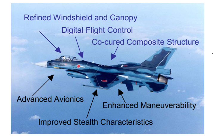
Fig2. Features of F-2